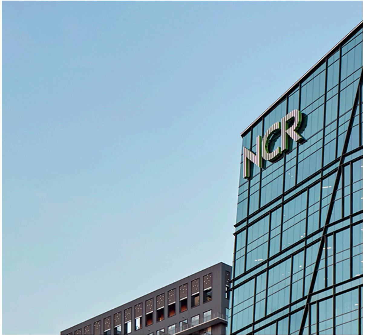
DudalPaine Architects Click image to expand